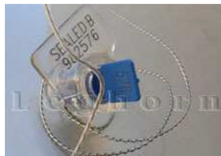
Twistseal double numbering