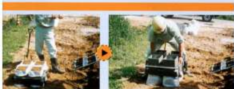
LIFT THE UPPER PART