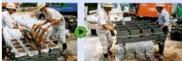
LIFT THE MAIN BODY

OPTIONAL PARTS MAKE YOUR WORK MORE EFFICIENT.