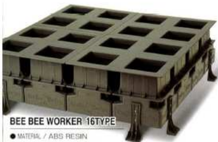
BEE BEE WORKER 16TYPE