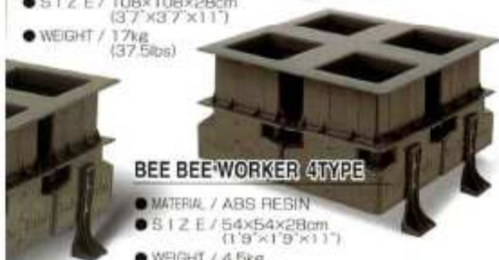
BEE BEE WORKER 4TYPE